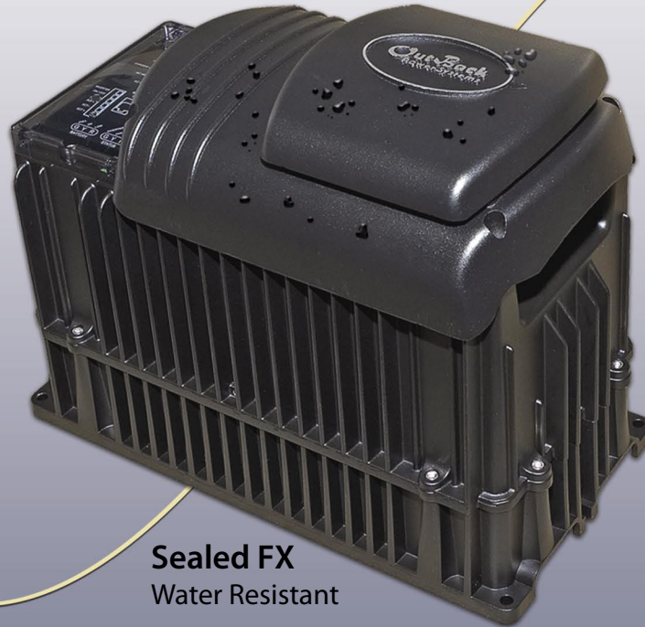
Sealed FX Water Resistant